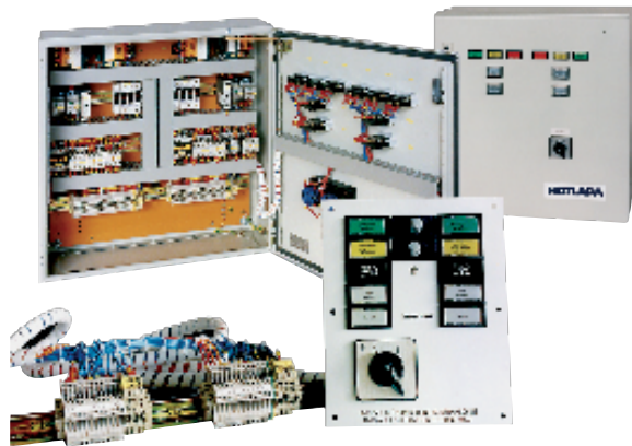
Automatic isolation system